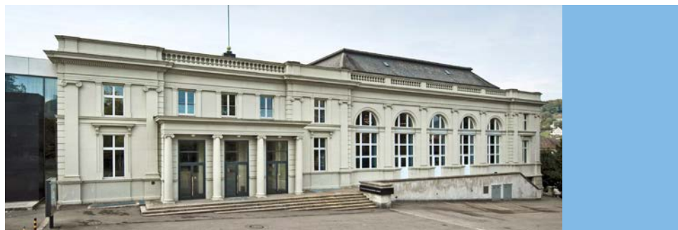
Kultur & Kongresshaus Aarau

Name of Bank: Aargauische Kantonalbank, 5001 Aarau Swift Code: KBAGCH22 IBAN Code: CH57 0076 1016 0126 7685 5 Account Holder: Klinik Barmelweid AG Account Name: «SSSSC Schlafmedizin»